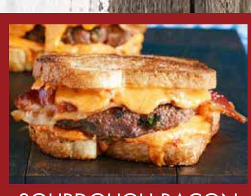
SOURDOUGH BACON CHEESEBURGER