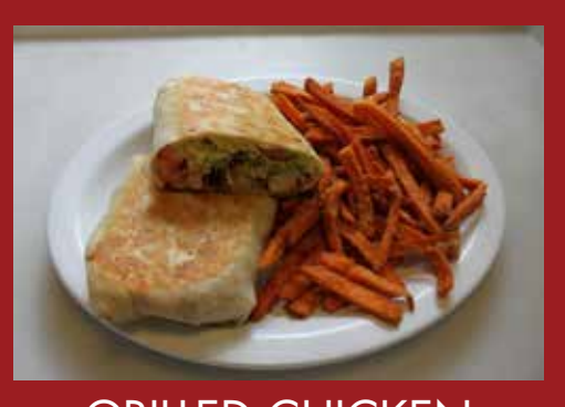
GRILLED CHICKEN WRAP