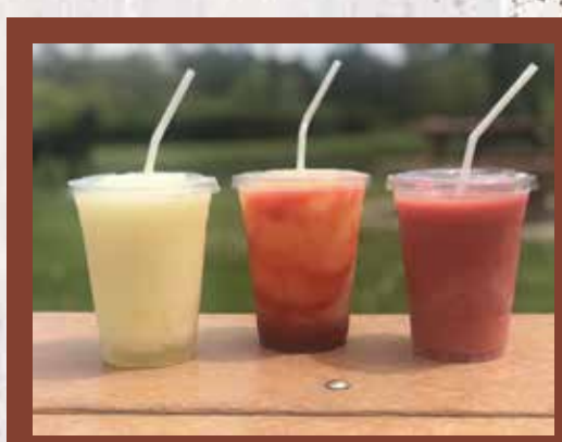
Smoothies and Frozen Lemonades