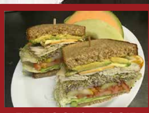
THE BOGUS VEGGIE