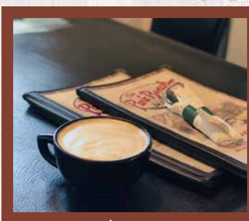
Lattes and Cappuccinos