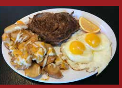
Steak & eggs