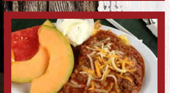
CHILI CHEESE OMELETTE